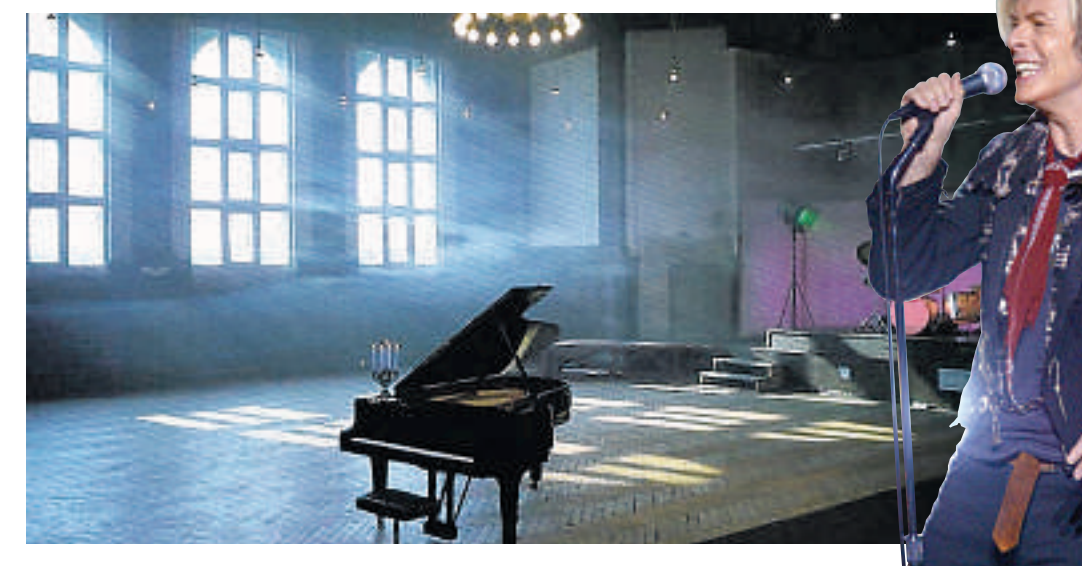
MUSICAL INSPIRATION Studio 2 at Hansa Studios, Berlin, a former haunt of David Bowie.

CRUISES NORTHERN HIGHLIGHTS Hurtigruten (0208 846 2666) offers four-night voyage ex-Tromso to Kirkenes and back, ex-Stansted March 14, from £781, incl return flights, three nights' half-board on ship and B&B in Tromso.