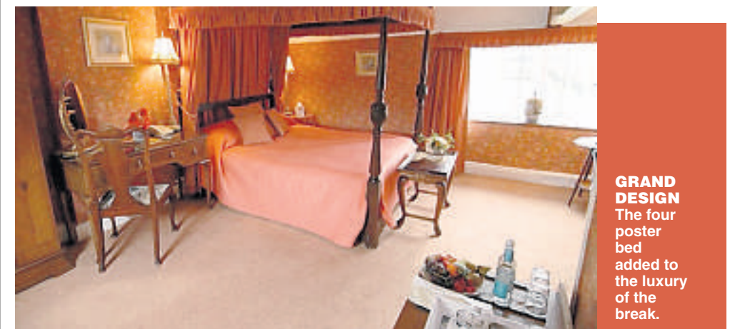
GRAND DESIGN The four poster bed added to the luxury of the break.

After that we did not think we would manage the two desserts — hot chocolate fondant served with a white chocolate and vodka sorbet, and a