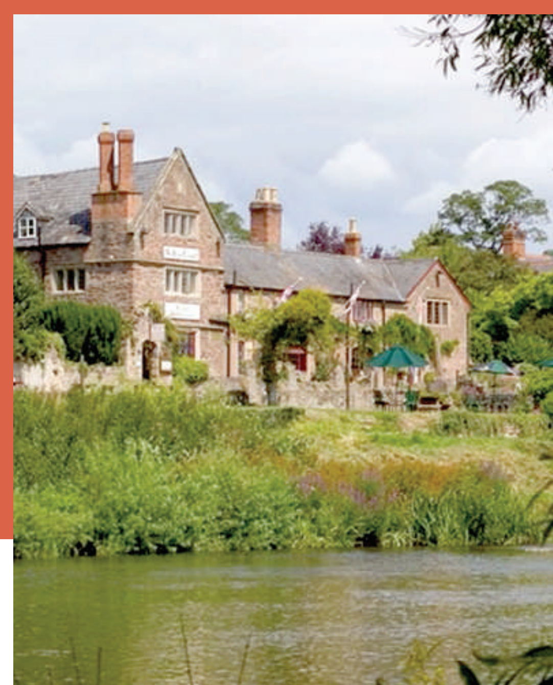
RIVER VIEWS The Wilton Court Hotel has stunning views over the River Wye or the hotel's vast grounds on the other side.

champagne and raspberry jelly served with a raspberry sorbet, lemon curd sauce and poppy tuiles. But we did, so delicious was everything.